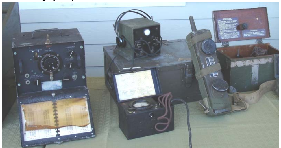
WWII field radios