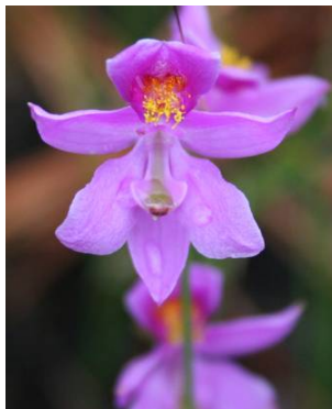
Photo of Many-flowered Grass Pink