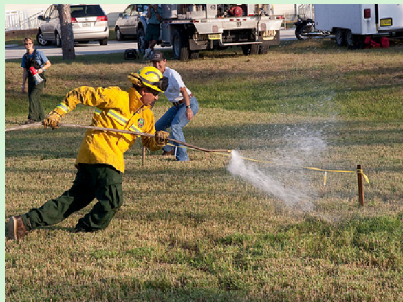
JDSP's Fire Team battles the Division of Forestry and win the gold shovel in the Firefighter Relay.

On October 23 rd , Jonathan Dickinson had its fourth FireFest event, complete with a Haunted River Trail where campers turned into Zombies and had a cannibal picnic! In the Firefighter Relay the Jonathan Dickinson Fire Team beat the Division of Forestry Team and won back the coveted Golden Shovel. Visitors could hop on a hayride through the quite wilderness of the park, and younger kids enjoyed a maze inside the Kimbell Center and made spiders and bats to decorate the "Wild and Creepy Loxahatchee River" displays. The final count of visitors in the park for FireFest was a staggering 2,534. We would like to especially thank all volunteers and AmeriCorps members who helped make this a fun, safe, and successful event!