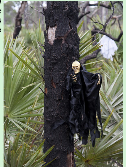
A ghost hangs from the branch of a charred Slash Pine on the Haunted River Trail.