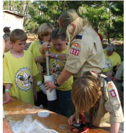
Boy scout add core sample to sorting bucket